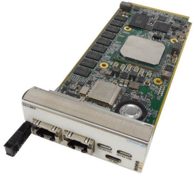
Figure 1: AMC763

Linux OS is standard on the AMC763, consult VadaTech for other options.