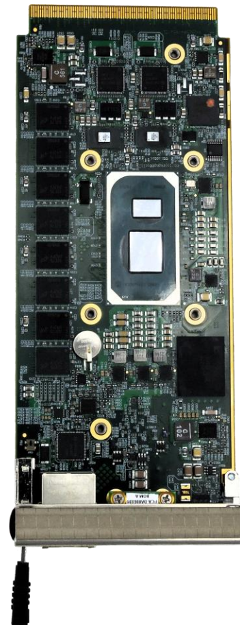
Figure 2: AMC767 without Heatsink