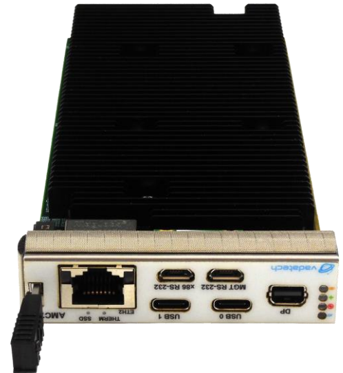
Figure 1: AMC767

The module provides TPM (Trust Management Platform) for secure boot.