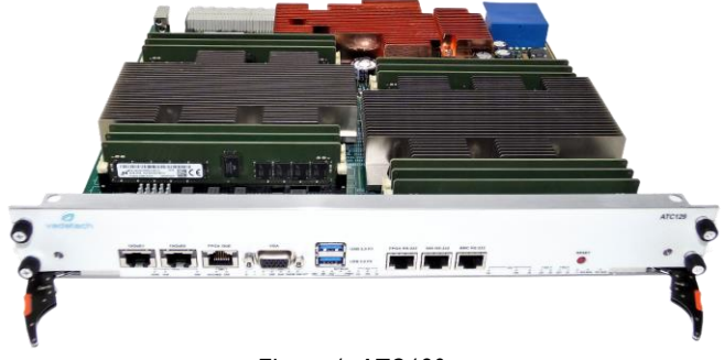
Figure 1: ATC129

The ATC129 can be ruggedized for harsh environments. See customer ordering options for conformal coating.