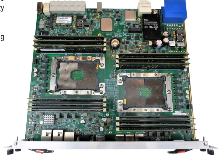
Figure 2: ATC129 Top View Without CPU and Heatsinks