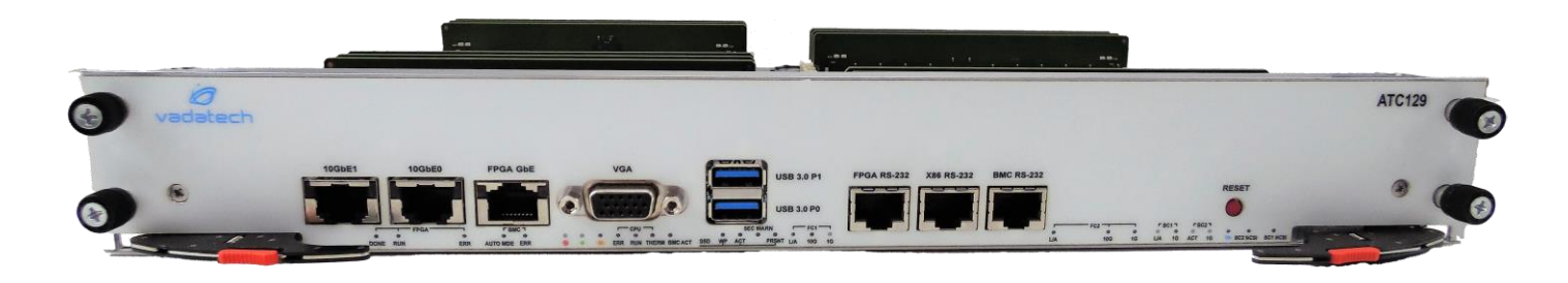
Figure 3: ATC129 Front Panel View