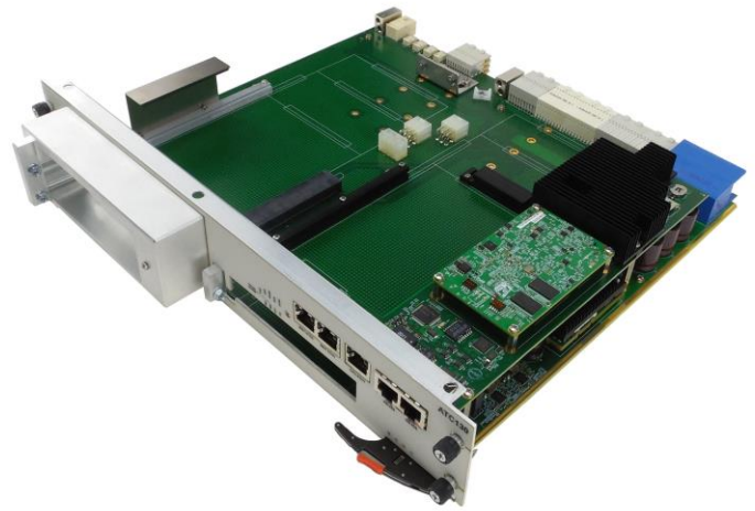
Figure 1: ATC130

The ATC130 can be ruggedized for harsh environments. See customer ordering options for conformal coating.