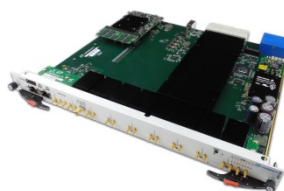
ATC136 – 2.6 GSPS A/D Converter