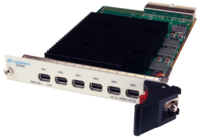
Figure 1: CP344

The CP344 features AMD's graphics processor chip (E6760) which enables dual HD decode of H.264, VC-1, MPEG4 and MPEG2 compressed video streams. The board offers up to 1 GB of GDDR5 memory and supports up to 6 independent displays with resolutions up to 3840x2400 @ 60 Hz, depending on number or ports used. The CP344 is PICMG 2.0 R 3.0 compliant and is available in the 3U size (a 6U panel is available). The CP344 board is not PCI +5 V signaling compatible.