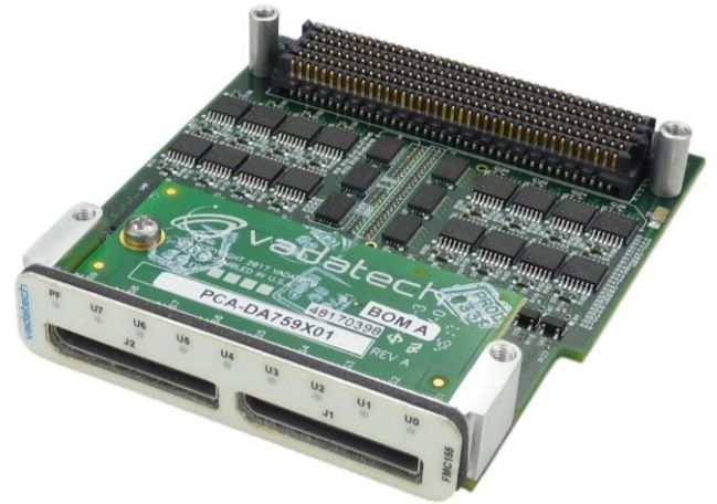
Figure 1: FMC155

Each of the single-ended Ports can be configured as input or output. The RS-485/422 configuration can be selected as full-duplex RS-422 (independent RX/TX pairs with RX termination) or half-duplex RS-485 (RX/TX pairs tied together, no termination onboard) based on the ordering option. The FMC155 can provide power of up to 12W to an external module.