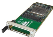
AMC532 Stratix-V FPGA