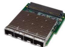
FMC109 Quad SFP+ FMC