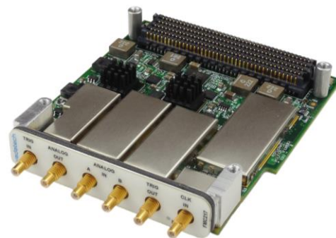
Figure 1: FMC217

The module allows one of the inputs to be configured as Trigger Input or Output. Further the ADC TMSTP signal input source could be configured to come from the FPGA or the Trigger In.