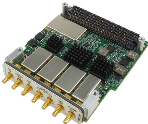
Figure 1: FMC253

The unit provides a Trigger Input/Output, clock and all analog Input/Output via SSMC connectors.