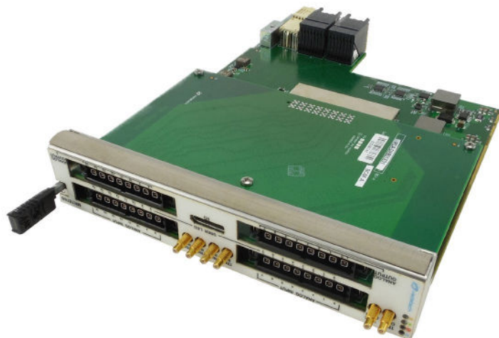
Figure 1: MRT576B

VadaTech offers a wide range of MicroTCA.4 products, including full systems. Contact your local salesperson or representative for details.