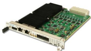
AMC523 DAC Converter