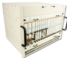
VT811 MTCA.4 Chassis