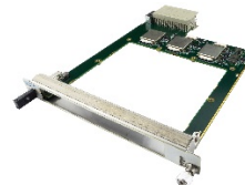
MRT523 12-ch A/D Converter RTM for AMC523