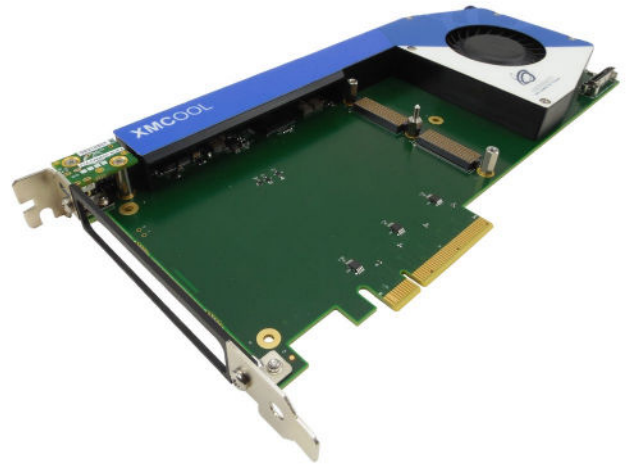
Figure 1: PCI109

Module has ordering option per VITA 42 or VITA 62.