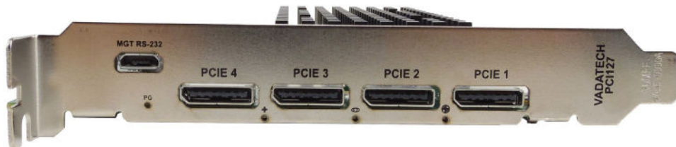
Figure 3: PCI127 Front Panel