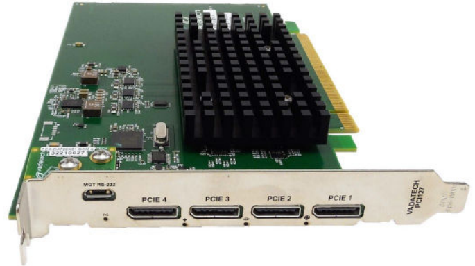
Figure 1: PCI127

The PCI127 allows expansion to an external module via quad OCuLink x4 connectors as a combined x16, or dual x8 or quad x4.