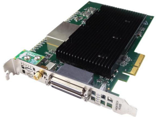
Figure 1: PCI325

Since the hardware is reprogrammable, many other serial protocols are possible. Please contact your VadaTech sales representative with your serial protocol needs to discuss how a unique protocol load can be developed to support your application if one does not already exist.