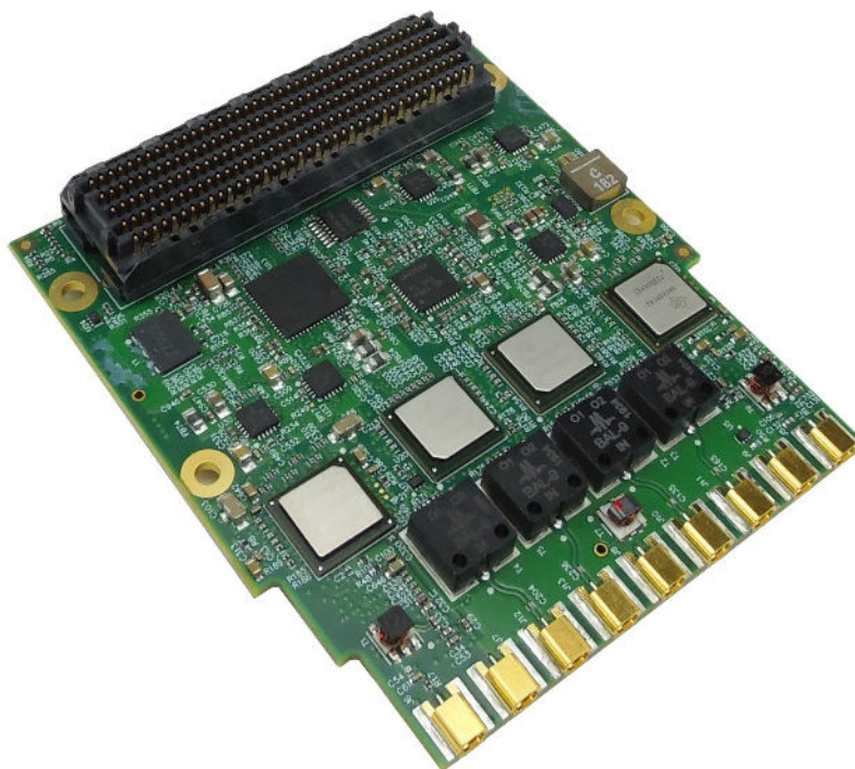
Figure 1: SOF208