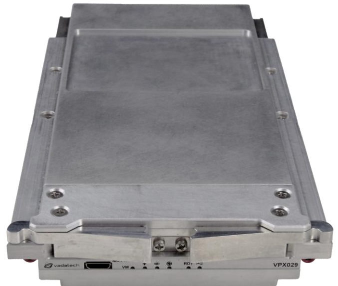
Figure 2: VPX029 Top View