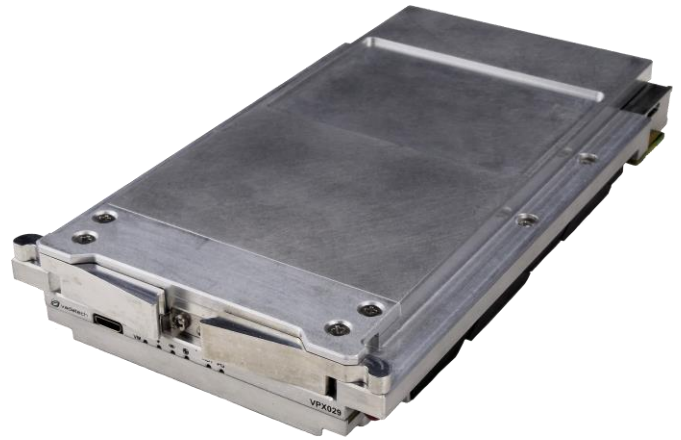
Figure 1: VPX029