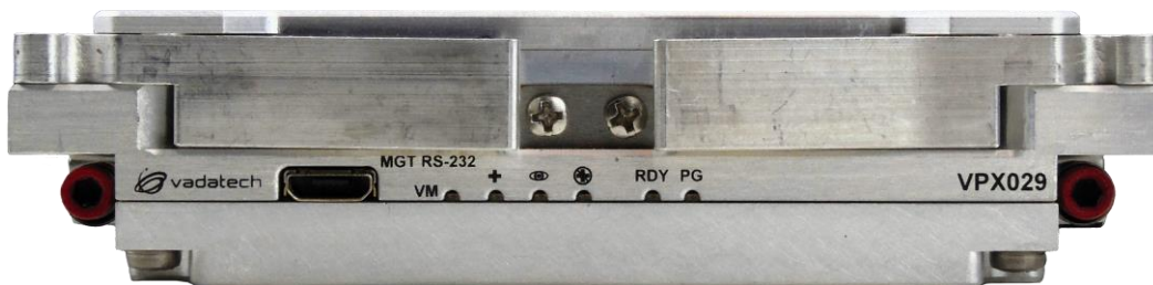
Figure 3: VPX029 Front View