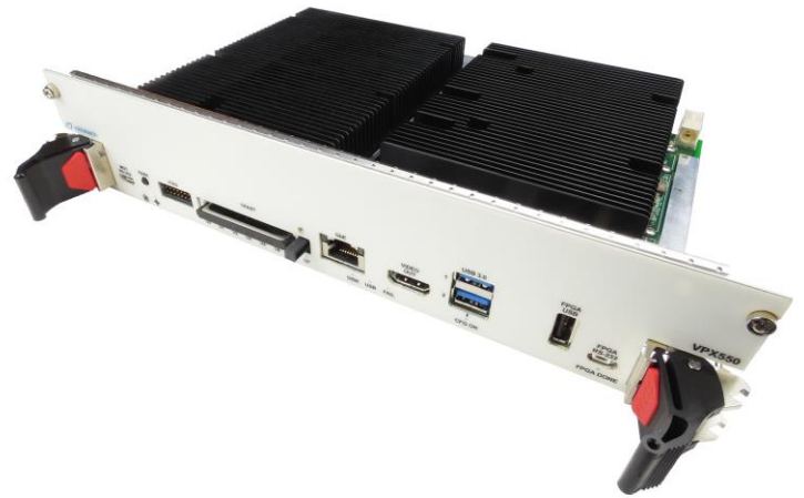
Figure 1: VPX550

Please contact VadaTech for details of Conduction Cooled versions.