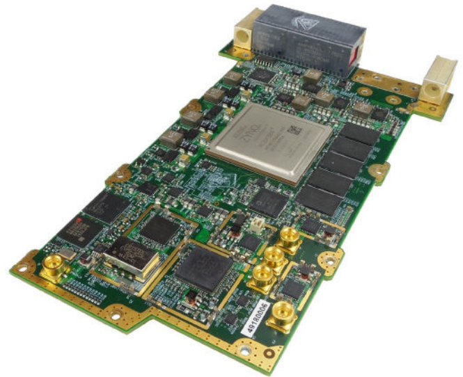
Figure 2: VPX571 (without Front Panel)