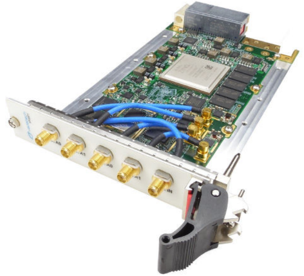
Figure 1: VPX571

The module has onboard 64 GB of Flash, 128 MB of Boot Flash and an SD Card as an option.