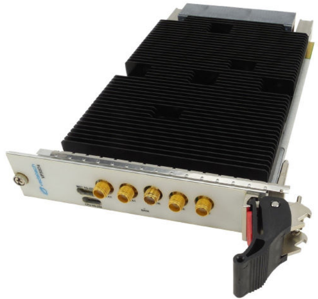
Figure 1: VPX574

The module has onboard 64 GB of Flash, 128 MB of Boot Flash and an SD Card as an option.