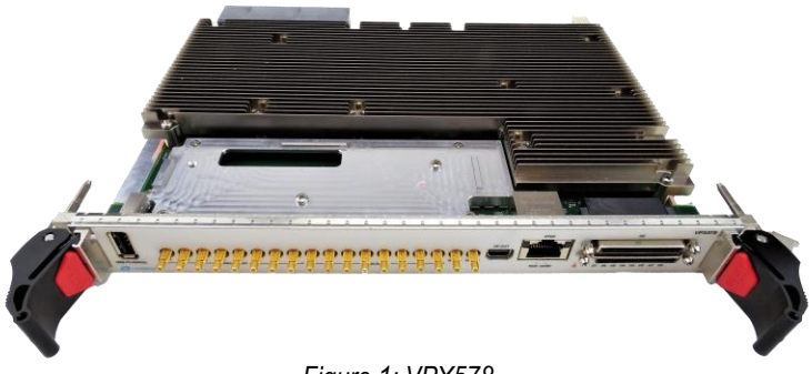
Figure 1: VPX578

Onboard microcontroller implements Tier-2 health management.