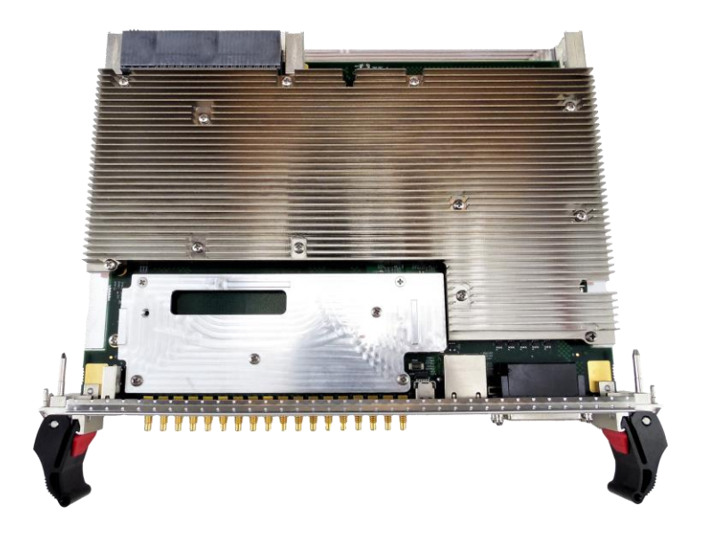
Figure 2: VPX578 Top View