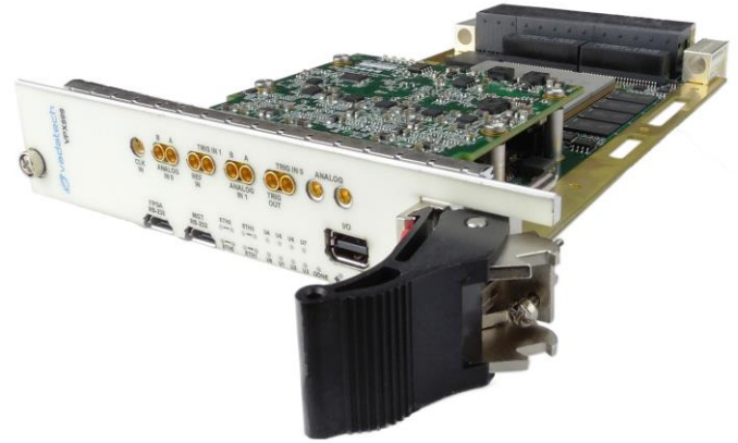
Figure 1: VPX589

Please contact VadaTech for details of Conduction Cooled versions.