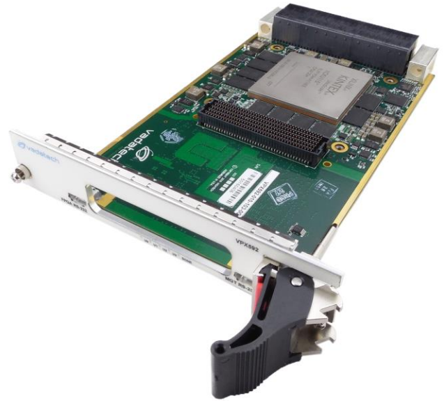
Figure 1: VPX592

Please contact VadaTech for details of Conduction Cooled versions.