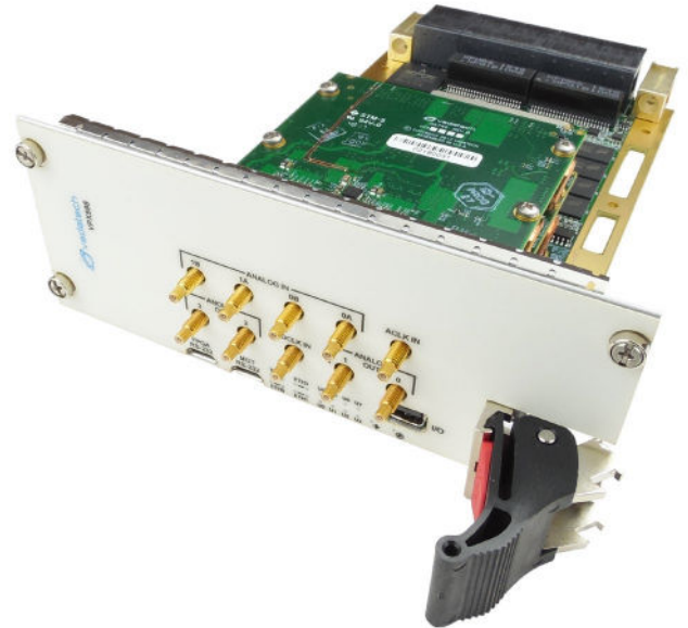
Figure 1: VPX598

Please contact VadaTech for details of Conduction Cooled versions.