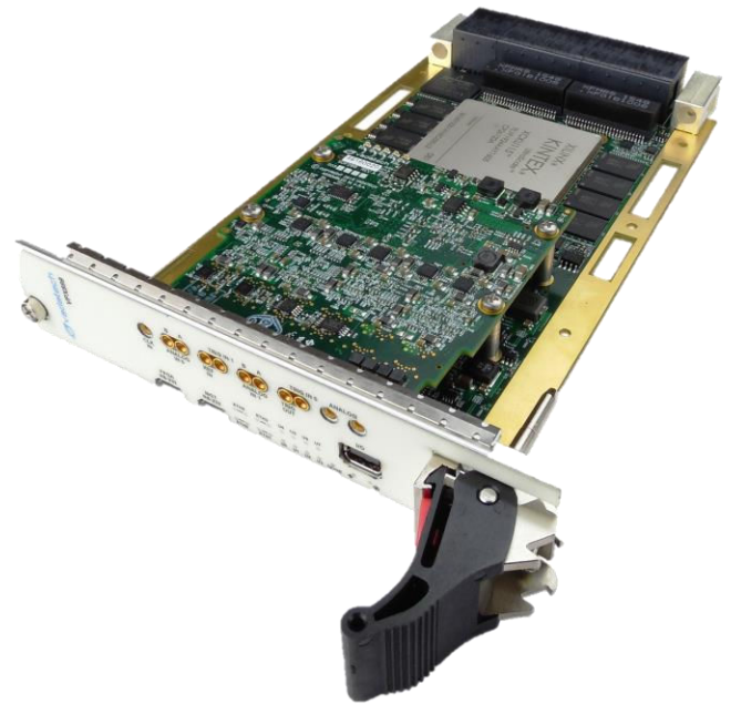
Figure 1: VPX599

Please contact VadaTech for details of Conduction Cooled versions.