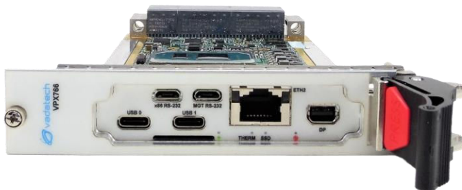
Figure 2: VPX766 Front Panel View