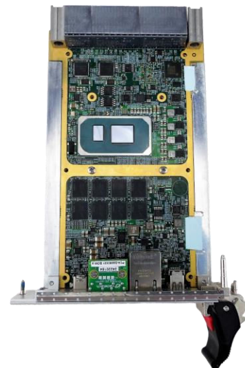
Figure 3: VPX766 Top View