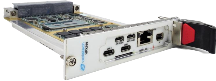
Figure 1: VPX766

The unit is available in a range of temperature and shock/vib specifications per ANSI/VITA 47, up to V3 and OS2.