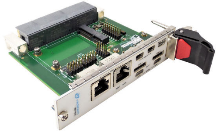
Figure 1: VRT703C

The VRT703C provides an easy access to the I/O ports routed to the P1 and P2 connectors of the VPX703. These includes dual USB, RS-232 for both management and payload, dual 1553 ports, JTAG for CPU, dual GbE as well as mSATA socket for storage. The module has an x4 OCuLink to expand to an external device via PCIe x4.