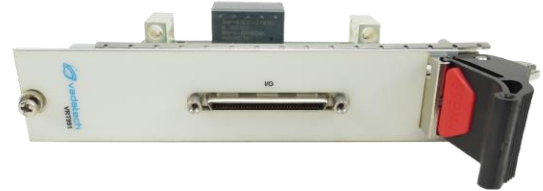
Figure 1: VRT991

The VRT991 is a 3U VPX Rear Transition Module that routes the front module P1 ports 8-15 and P2 ports 0-7 to the VHDCI Connector style. The module is passive and does not have any active components.