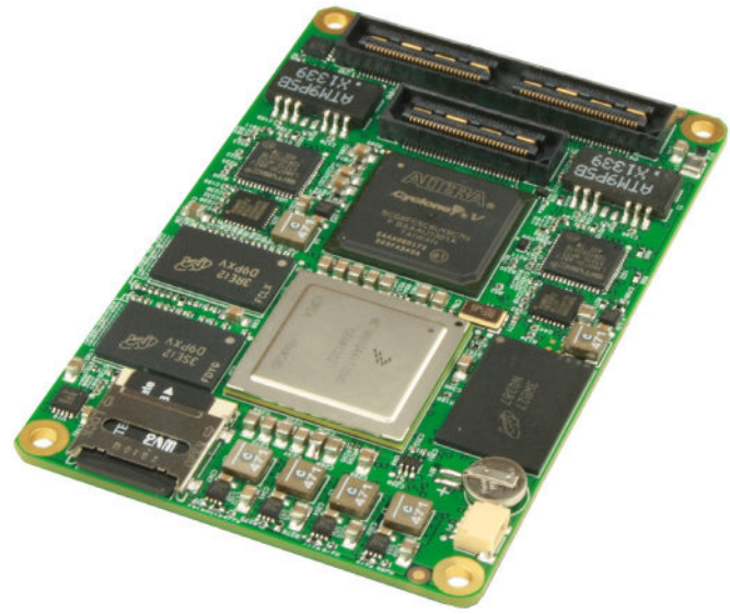
Figure 1: VT003

VadaTech's Scorpionware™ software can be used to access information about the current state of the Shelf or the Carrier, obtain information such as the FRU population, or monitor alarms, power management, current sensor values, and the overall health of the Shelf. The software GUI is very powerful, providing a Virtual Carrier and FRU construct for a simple, effective interface.