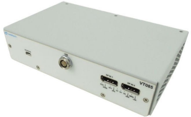
Figure 1: VT085

The VT085 is orderable with a fanless enclosure or optionally as a board-level product without enclosure. This allows customers to fully integrate the unit into their own user console