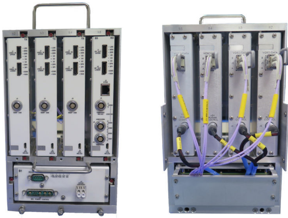
Figure 3: Conduction cool deployment example