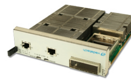
AMC738 100G Processor AMC