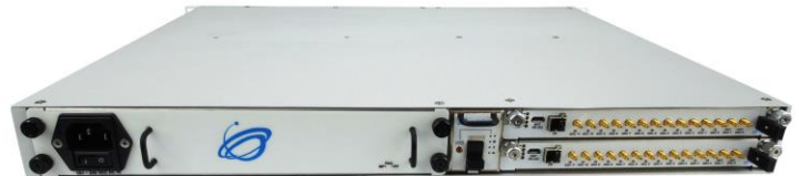
Figure 2: VT816 Rear View