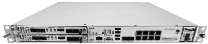
Figure 1: VT816 Front View

In some platform configurations the total cooling capacity of the chassis can be affected by airflow restriction caused by certain AMCs. This is especially so when using multiple high-power AMCs, which typically have larger heatsinks. Please consult VadaTech sales regarding AMC placement for optimal cooling.