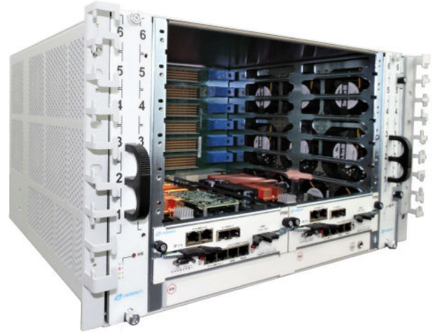
Figure 1: VT831 Front View

VadaTech's Scorpionware software can be used to access information about the current state of the Shelf or the Carrier, obtain information such as the FRU population, or monitor alarms, power management, current sensor values, and the overall health of the Shelf. The software GUI is very powerful, providing a Virtual Carrier and FRU construct for a simple, effective interface.