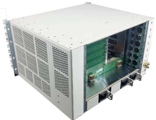
Figure 2: VT831 Rear View