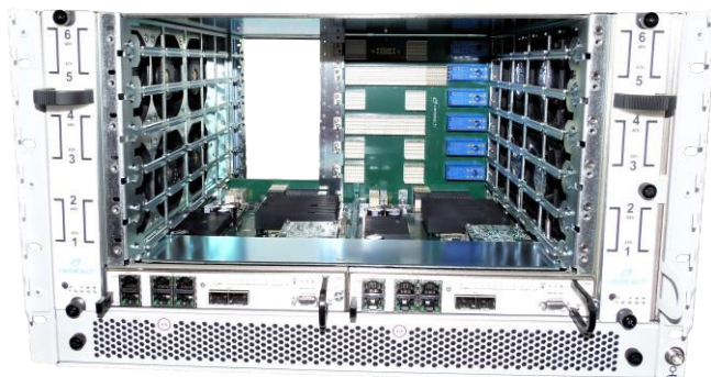
Figure 1: VT837

VadaTech's Scorpionware software can be used to access information about the current state of the Shelf or the Carrier, obtain information such as the FRU population, or monitor alarms, power management, current sensor values, and the overall health of the Shelf. The software GUI is very powerful, providing a Virtual Carrier and FRU construct for a simple, effective interface.