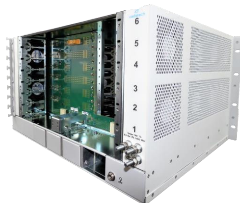
Figure 4: VT837 Rear View 2