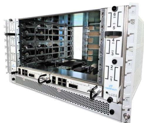
Figure 2: VT837 Front View 2