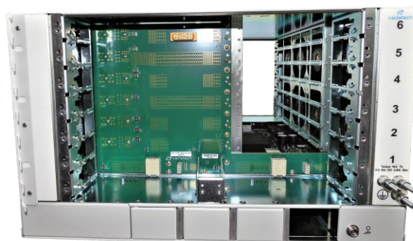
Figure 3: VT837 Rear View