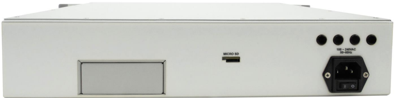
Figure 4: VT981 Rear View