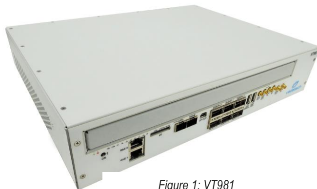
Figure 1: VT981

The chassis mounting provision allows the unit to be in a 19" rack or ceiling mounted.