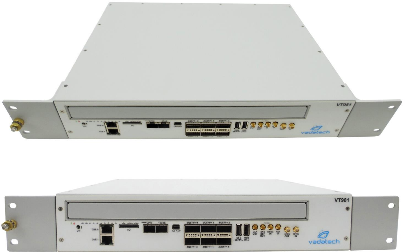
Figure 3: VT981 Front View