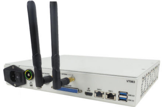
Figure 2: VT983 with Antenna