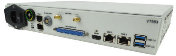
Figure 1: VT983

The VT983 has a Layer 2 Managed Gigabit Ethernet Switch which provides dual GbE through RJ-45 interface to the Rear Panel and allows interconnection among the subsystems. System cooling is from right to left with the intelligent fan controller.