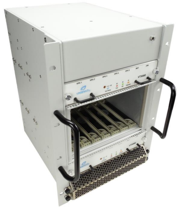
Figure 1: VTX660 Front View

There is an optional JSM to provide JTAG access to the front.