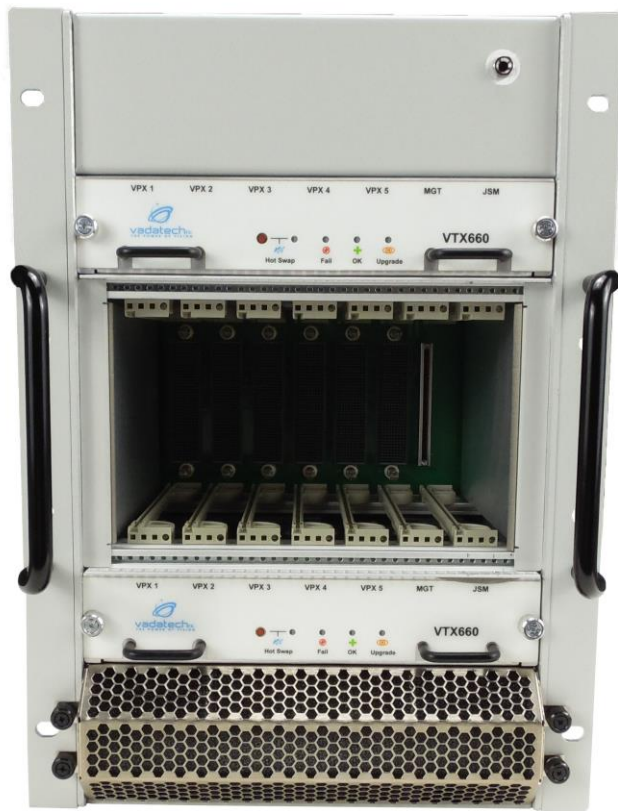
Figure 4: VTX660 Chassis Layout - Front