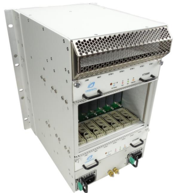
Figure 2: VTX660 Rear View