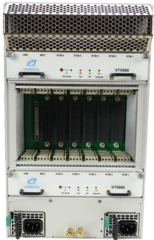
Figure 5: VTX660 Chassis Layout - Rear