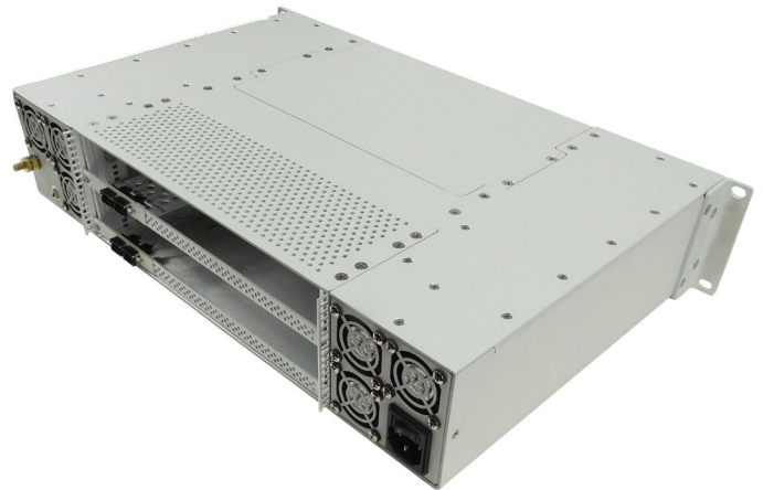
Figure 2: VTX995 Rear View