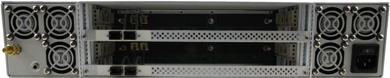
Figure 4: VTX995 Chassis Layout - Rear View