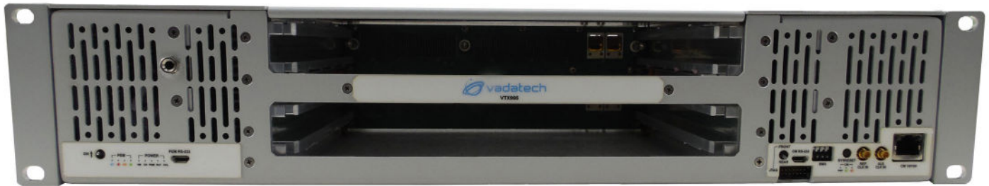
Figure 3: VTX995 Chassis Layout - Front View