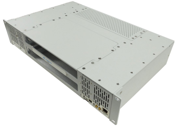
Figure 1: VTX995 Front View

The backplane breaks-out the JTAG signals via a header connector to enable external connection of a JTAG probe.