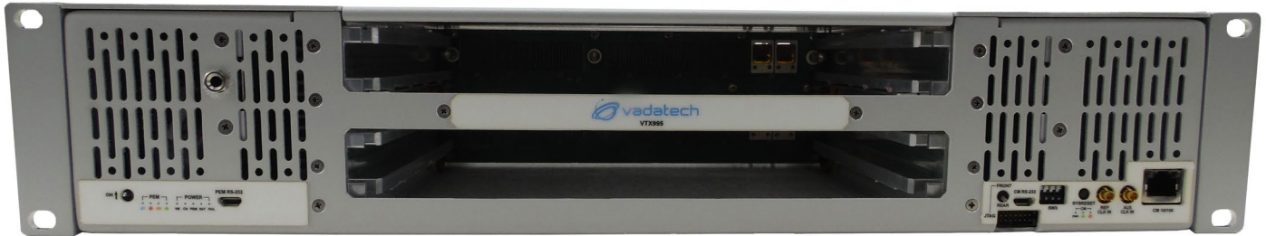
Figure 3: VTX995 Chassis Layout - Front View