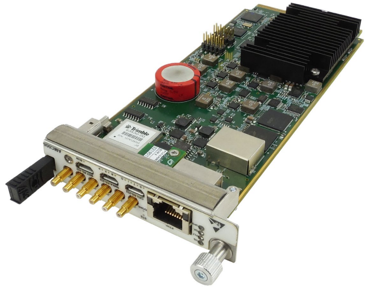
Figure 1: AMC006

The module’s console is available via front serial or SSH via Ethernet. Locking/holdover status is also available via IPMI sensors. A secondary serial port enables GPS NMEA data in/out.