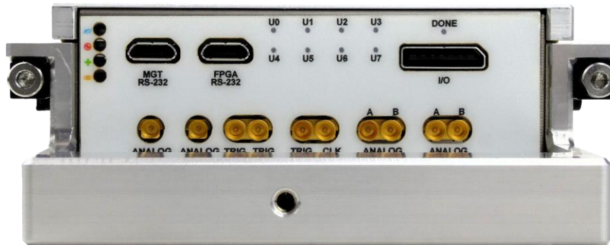
Figure 6: AMC549 Front Panel View