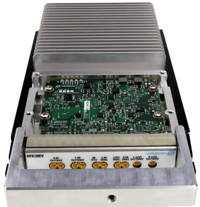
Figure 3: AMC549 Front View with SOF221