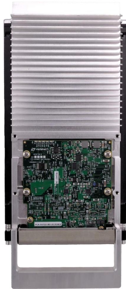
Figure 5: AMC549 Top View with SOF221