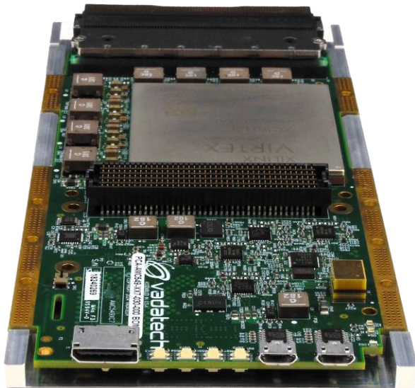
Figure 2: AMC549 Front View