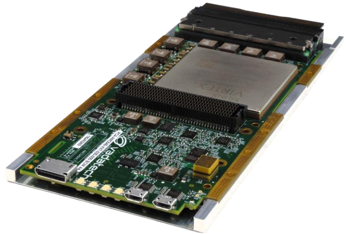
Figure 1: AMC549

List of SOFI Module: A/D & D/A (vadatech.com)