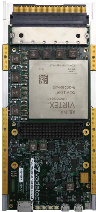
Figure 4: AMC549 Top View