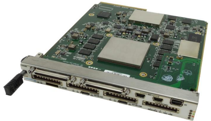
Figure 1: AMC574

The Module has onboard 64 GB of Flash, 128 MB of boot flash and an SD Card as an option.