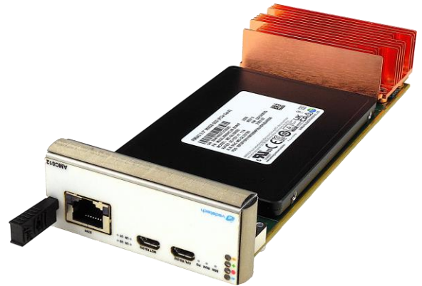
Figure 1: AMC612

The AMC612 is available in both air-cooled (MTCA.0 and MTCA.1) and rugged conduction-cooled versions (MTCA.2 or MTCA.3, contact sales for details).