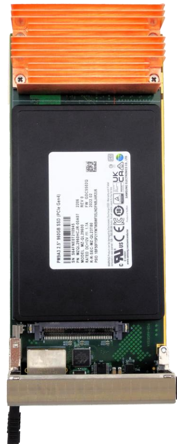
Figure 2: AMC612 Top View