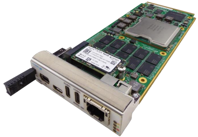
Figure 1: AMC770

Linux OS is standard on the AMC770, consult VadaTech for other options.