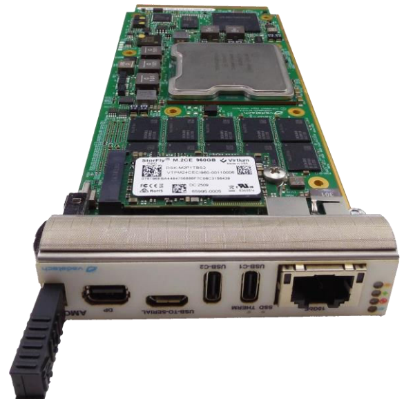
Figure 2: AMC770 Front View