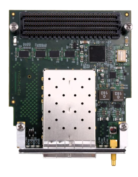
Figure 2: FMC121 Top View