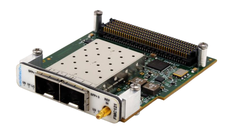
Figure 1: FMC121

The FMC121 is protocol-agnostic and has a low jitter fractional PLL which can lock to CLK2 and CLK3 coming from the Carrier or be free running. The fractional PLL can generate two separate clocks to the two GBT clock pins and can provide two more additional clocks on CLK0 and CLK1 for the carrier. Further the PLL could also synchronize to an external clock source via its front panel SSMC.