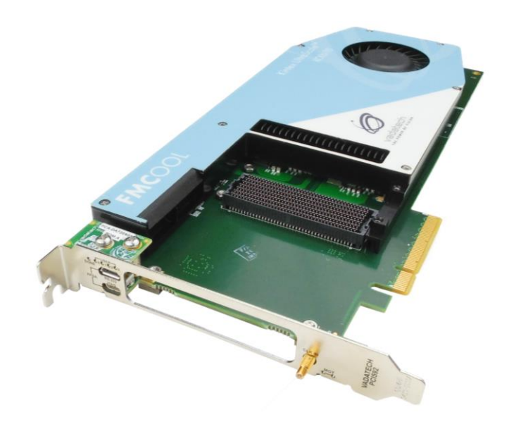
Figure 1: PCI592

PCI592 provides active cooling of the FPGA and FMC+ (the module does not support HSPCe connector) making it appropriate for power-hungry applications or those requiring temperature stability for good performance.