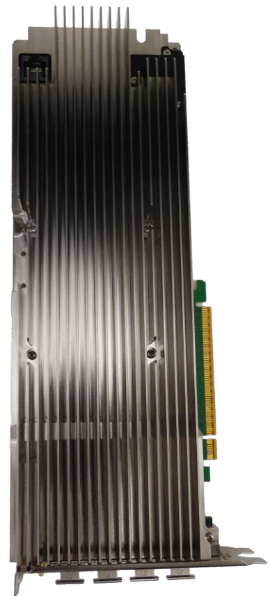
Figure 3: PCI594 Top View