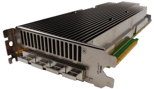
Figure 1: PCI594

Active cooling of the module and option with passive cooling. The passive cooling requires a chassis that forces air over the PCI594 heat sink, such as VadaTech's VT808 chassis.