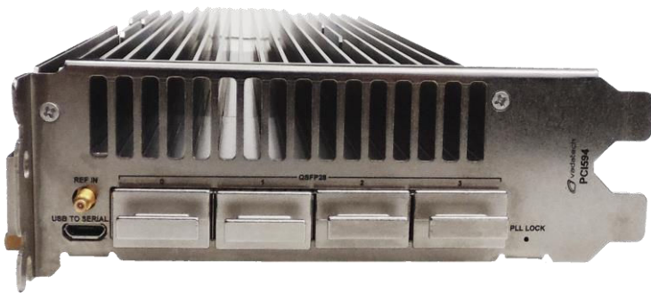
Figure 2: PCI594 Front View