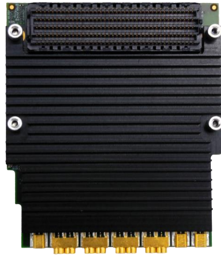
Figure 2: SOF206 Top View