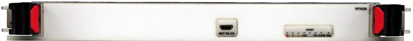
Figure 3: VPX028 Front Panel View