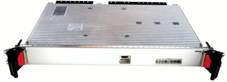
Figure 1: VPX028 Front View