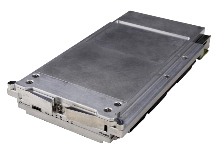
Figure 1: VPX029