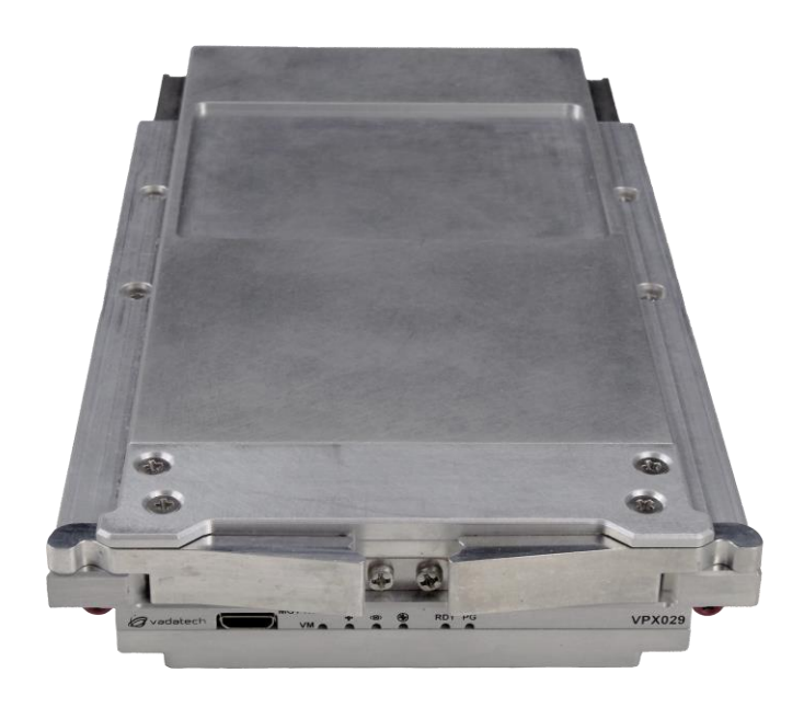
Figure 2: VPX029 Top View