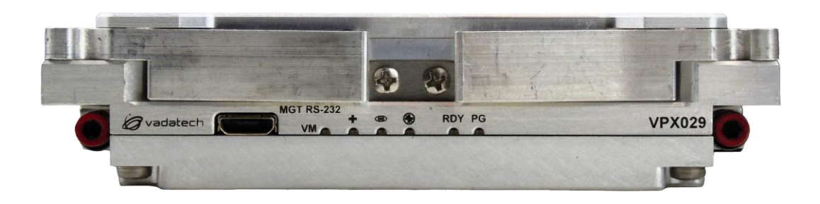
Figure 3: VPX029 Front View