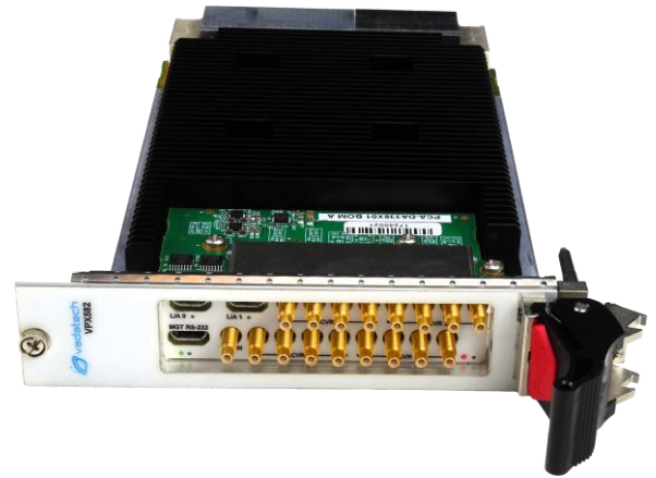
Figure 1: VPX582

The module has on board 64 GB of Flash and 128 MB of Boot Flash.