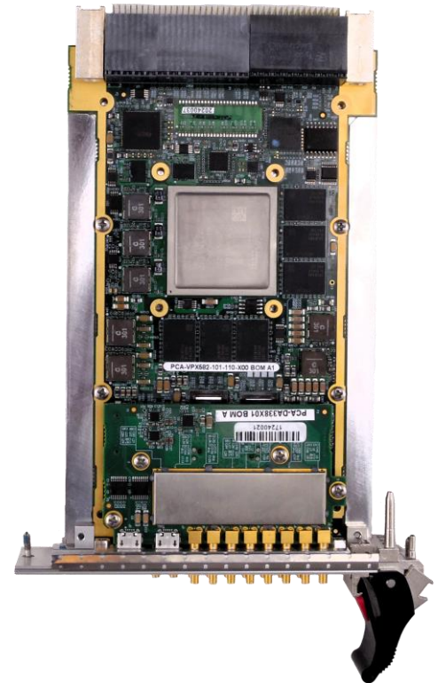
Figure 2: VPX582 Top View, No Heatsink