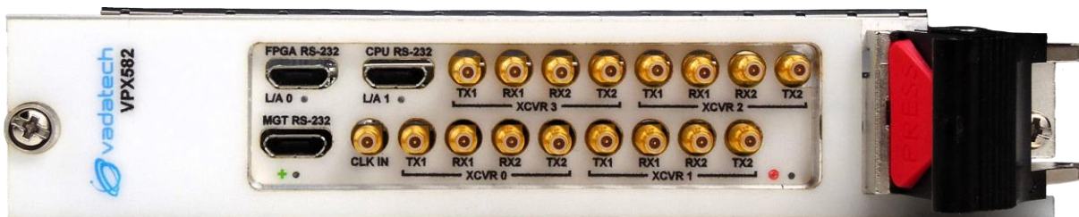
Figure 3: VPX582 Front Panel View